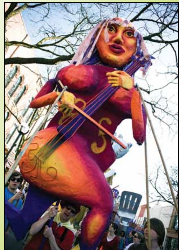
Ann Arbor's annual FestiFools parade (See page 10.)