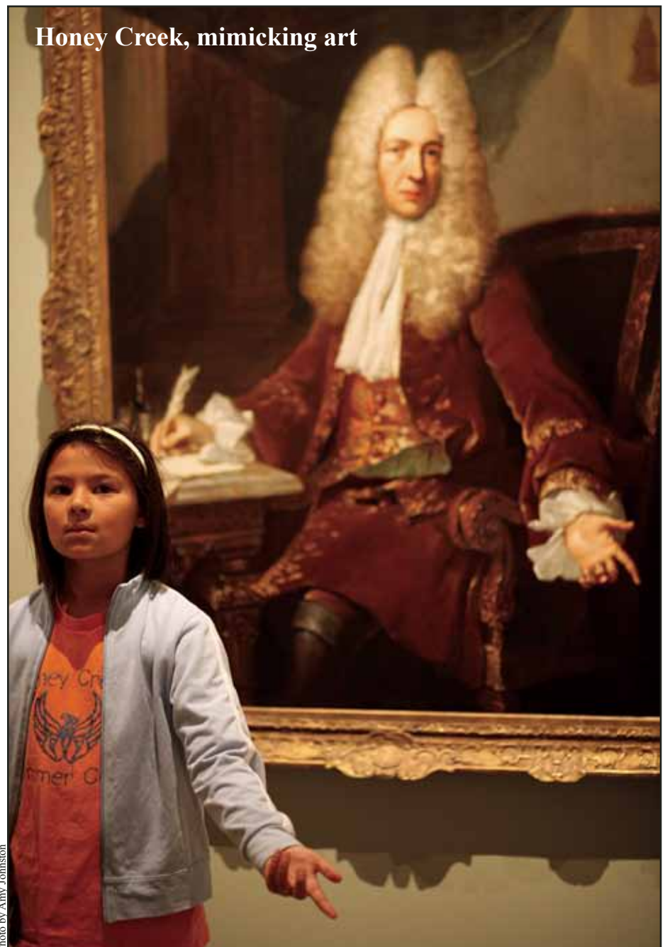
Honey Creek, mimicking art

Details and camp application at www.g4horsys.com or by email to g4horsys@aol.com