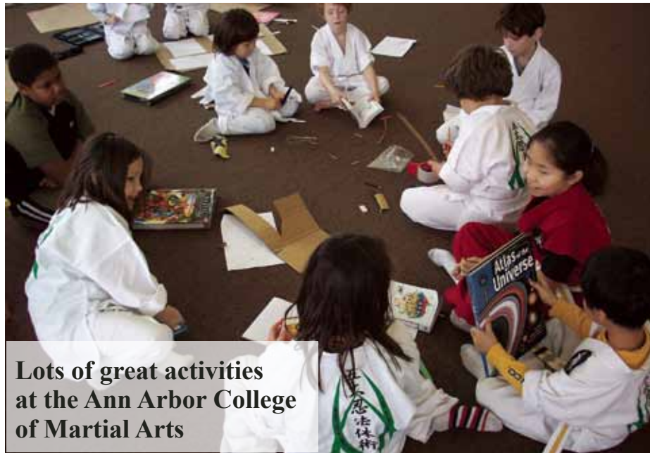
Lots of great activities at the Ann Arbor College of Martial Arts