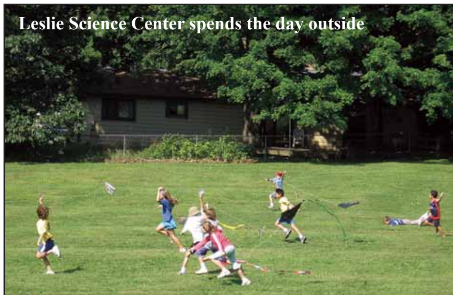
Leslie Science Center spends the day outside

Cost: Various- Early Bird Specials available