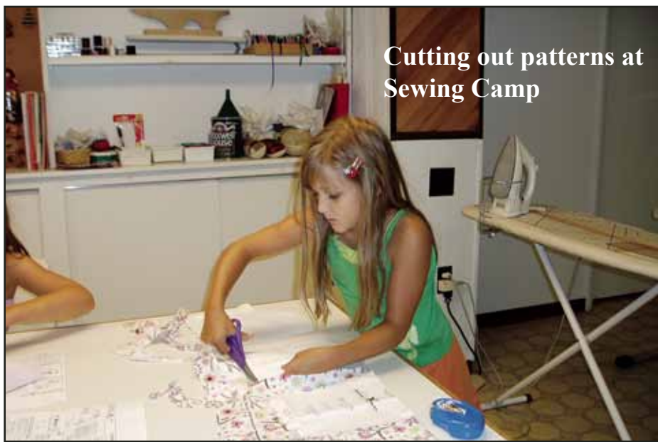
Cutting out patterns at Sewing Camp