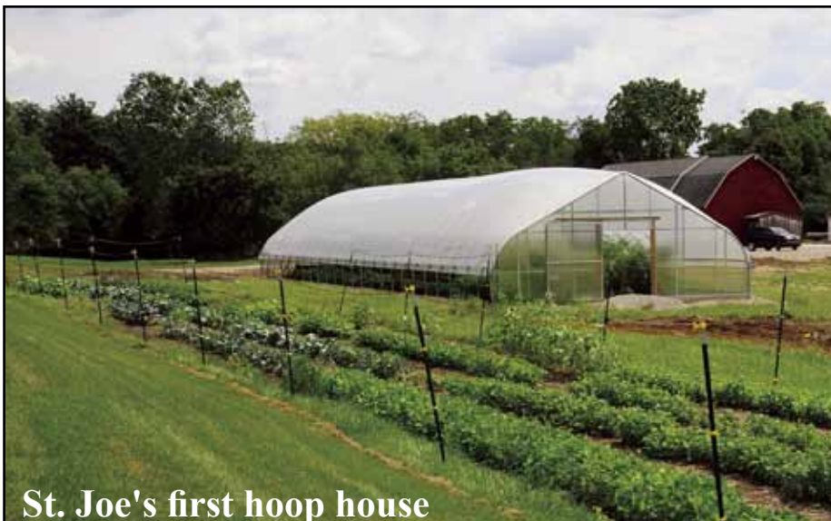
St. Joe's first hoop house

This year Americans will spend 49% of their food budget dining in at restaurants, ordering delivery, driving through fast food establishments, and eating meals prepared by other types of food vendors.